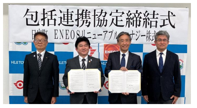
Signing Ceremony with Hiji Town

Common Areas of Collaboration Defined in the Agreements: