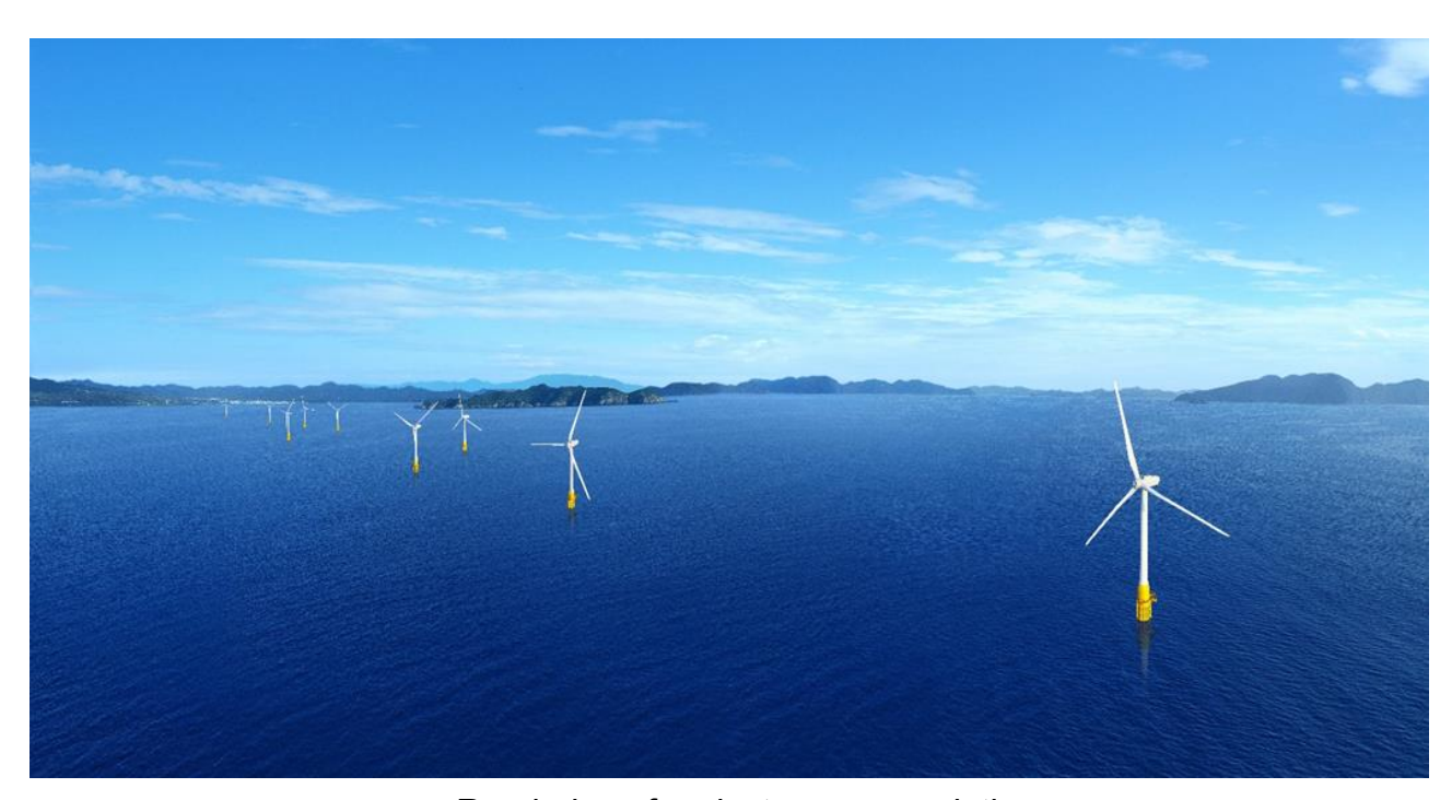
Rendering of project upon completion