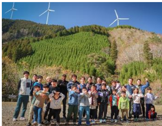
Recent photographs of Morotsuka Village in Higashiusuki District, Miyazaki Prefecture Left: Forest in Mimikawa drainage basin, Right: Wind-themed art event (November 2023)