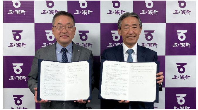
Signing ceremony at Gokase Town